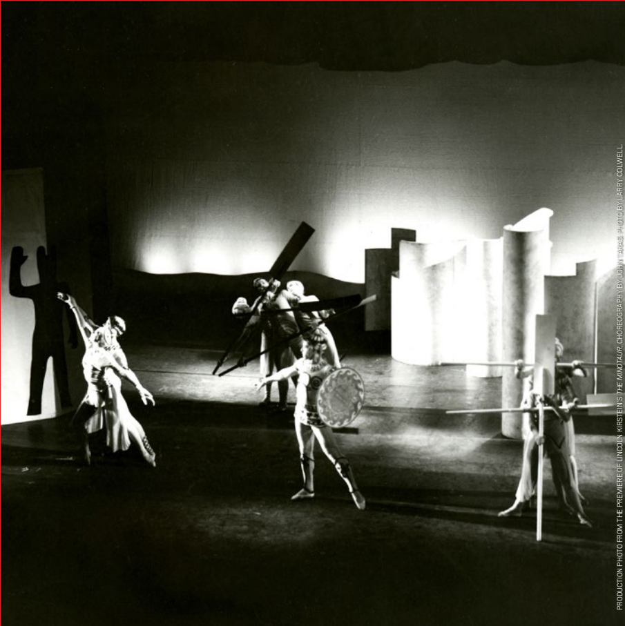
PRODUCTION PHOTO FROM THE PREMIERE OF LINCOLN WRESTLING THE MINOTAUR, CHOREOGRAPHY BY JOHN FARRAS.