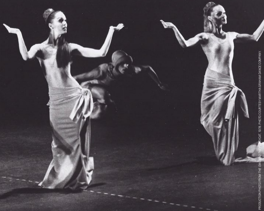
PRODUCTION PHOTO FROM THE ORIGINAL AND THE REVISYCAT, 1978.