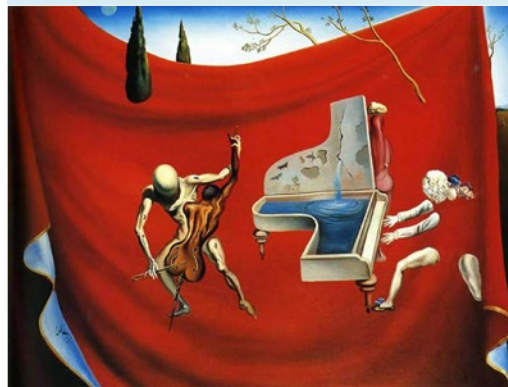
Cover image: Salvador Dalí, Music. The Seven Lively Arts "Red Orchestra" . Oil on canvas, 1957.