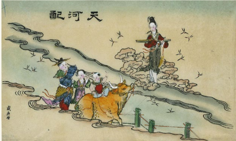
Rendezvous in the Milky Way.

Late 19th – early 20th century. Xylograph on thin Chinese paper.