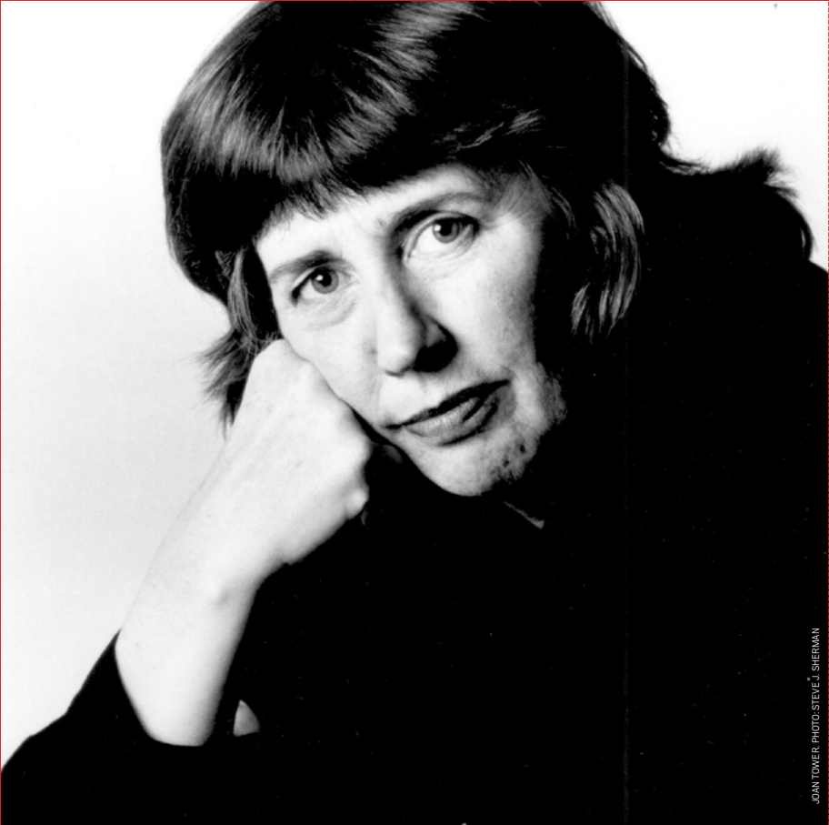
JOAN TOWER.