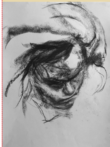
Cover art: Head of Beethoven, charcoal and chalk on paper, 18x24"

This recording was made possible in part by an anonymous donor.