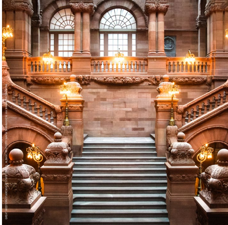
GREAT WESTERN STAIRCASE AT STATE CAPITOL IN ALBANY.

The New York State Capitol building was the most expensive government building of its time. Finished in 1899, this National Historic Landmark took 32 years to complete and cost $25 million dollars (roughly $747 million today). Also known as the “Million Dollar