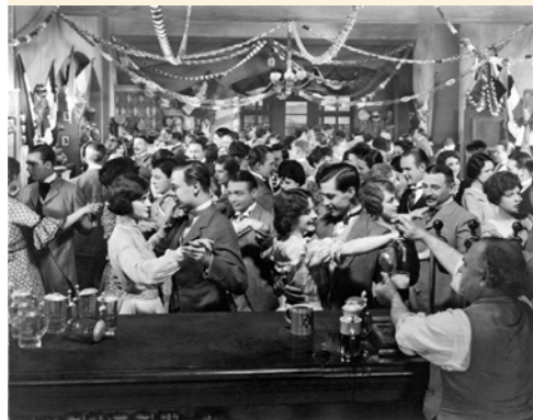
Cover image: A festive party scene from an early silent movie, Hollywood, California, early to mid 1920s.

This recording was made possible through the generous support of Adelphi University and an anonymous donor.