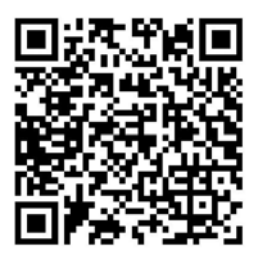
Scan code above for complete program.

For the complete booklet, please scan the QR code below.